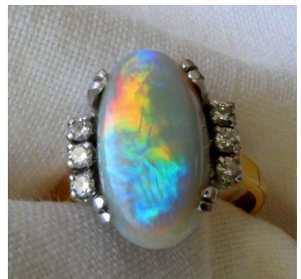
(Two photos of the same white opal ring from different angles demonstrating the play of colour)

Some of the most interesting forms of opal are not jewellery but opals formed in fossils. Opal is formed when silica rich water percolates through small cavities and channels under the right conditions of pH and other chemical influences, and possibly the action of organic matter and microbes. The Australian opal fields are famous for opalised fossils where opal is formed within buried shells, bones and petrified wood. Yes, we do have opal in the petrified wood at Jurassic Ark, but it is only low grade. The photo ( bottom right ) of high grade opal in fossil wood is of a log on display at the Brisbane Opal Museum. Note the log is compressed, like the logs at our Jurassic Ark dig site near Gympie QLD, indicating it has been waterlogged and squashed when it was buried, fossilised and infiltrated with silica.