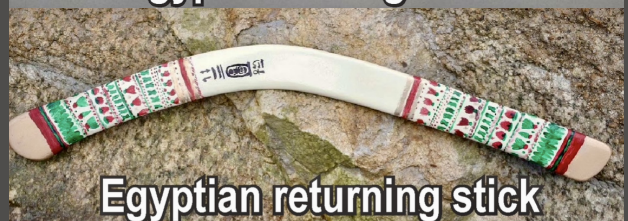
Egyptian returning stick

Proof that the Egyptians had returning boomerangs has been known since 1872 when English archaeologist and scholar Lt Gen Pitt Rivers F.R.S. reported he had made an accurate copy of an Egyptian boomerang and tested it by throwing it many times. He reported: "I also succeeded in at last