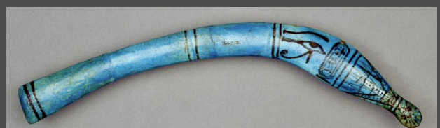
Egyptian killing stick

The New Testament reminds us Moses grew up in Egypt and was highly educated in all the ways of the Egyptians (Acts 7:22). Raised in Pharaoh's courts Moses would have known about about both returning and non-returning throwing sticks or boomerangs.