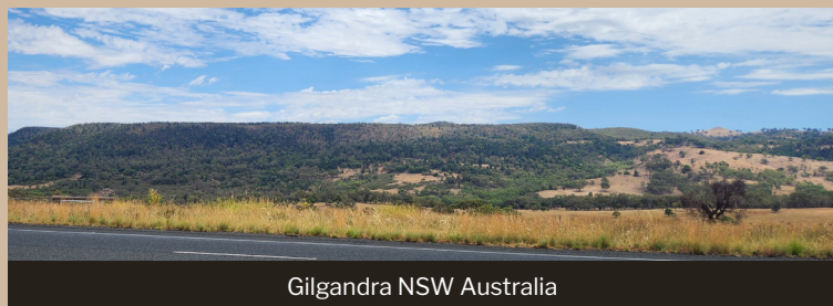
Gilgandra NSW Australia

The Creation Research team have been compiling evidence of these formations around the world including in recent trips in parts of Australia, USA and Morocco (see pictures). Here are just a few of the many pictures we have taken of these very common features in the landscape. Aussies, take a close look for them next time you go for a drive.