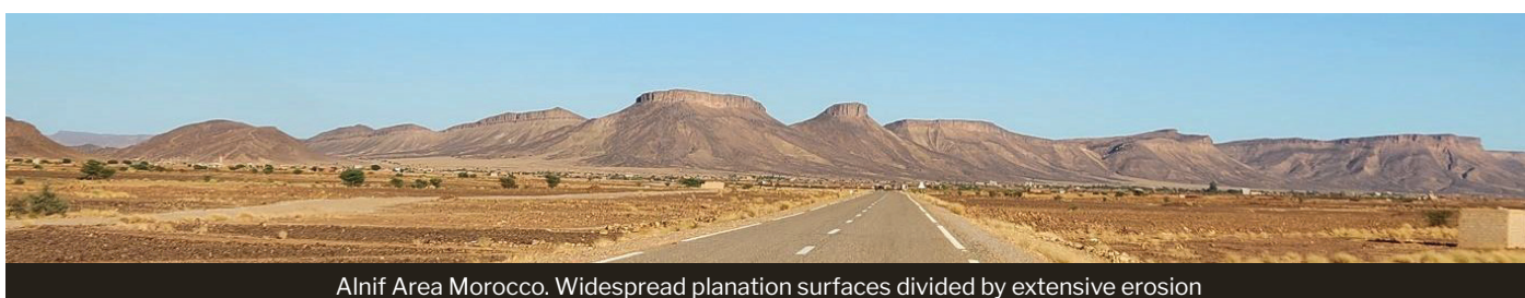
Alnif Area Morocco. Widespread planation surfaces divided by extensive erosion

Huge volumes of sediment (rock particles laid down by water) were deposited in the 150-day ascending phase of Noah's flood, some of these deposits being kilometres thick. At the end of this period, as the land surfaces were lifted or dropped, huge sheets of water started pouring off the land with incredible power. Fast flowing water is known to even gouge steel in a process called cavitation. Similarly, unconsolidated rock and sediments would be readily sheared flat by the force of flow, with canyons and gorges also carved out over short periods of time.