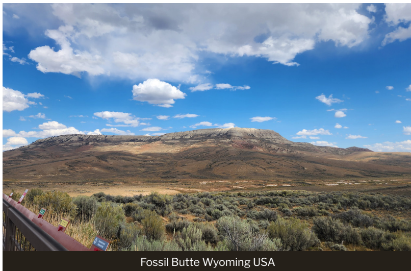
Fossil Butte Wyoming USA

A person's worldview influences the way they interpret evidence about the past. Scientists are no different and use an underlying philosophy to shape their interpretation of evidence. It follows therefore that if you have a false worldview, you are more likely to arrive at a false conclusion no matter how clever