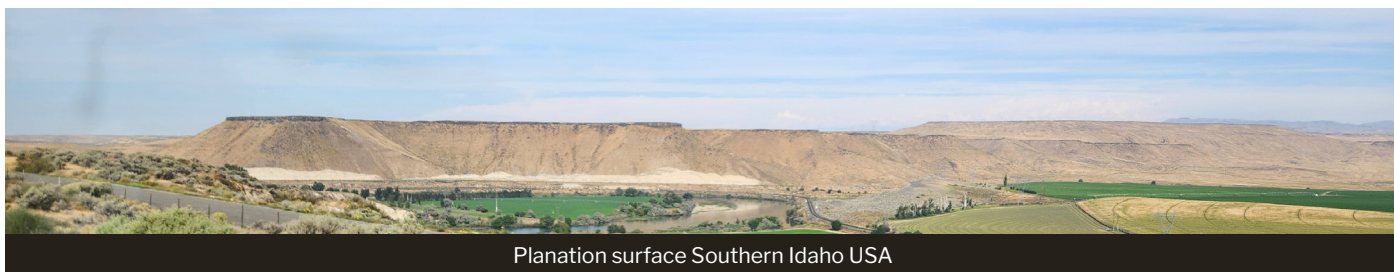
Planation surface Southern Idaho USA

One such landform that can be readily seen around the world by an attentive observer is labelled a planation surface. This is an area of land that has been "planed-off" by extensive sheets of running water. They are most obviously seen as plateaus, tabletop mountains and similar formations but may also occur as extensive lowland plains. A plateau, mesa and butte are terms for planation surfaces in decreasing order of size. One well known planation surface is the Fossil Butte in southern Wyoming USA.