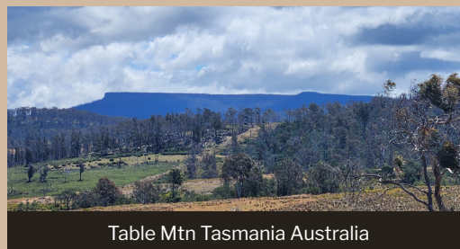
Table Mtn Tasmania Australia